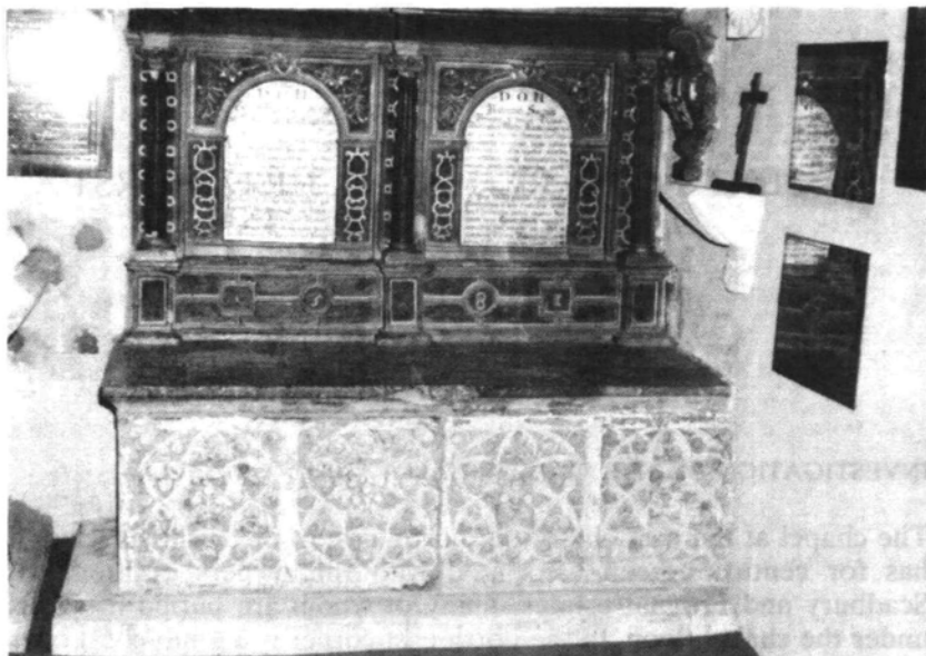
The Walsingham Tomb in the north-east Corner of Scadbury Chapel

was also given for the re-siting of the large monument to Earl Sydney ( d. 1890) from its position near the centre of the chapel to the north-west corner in order that the area could be more conveniently used for purposes of worship (Plate II).