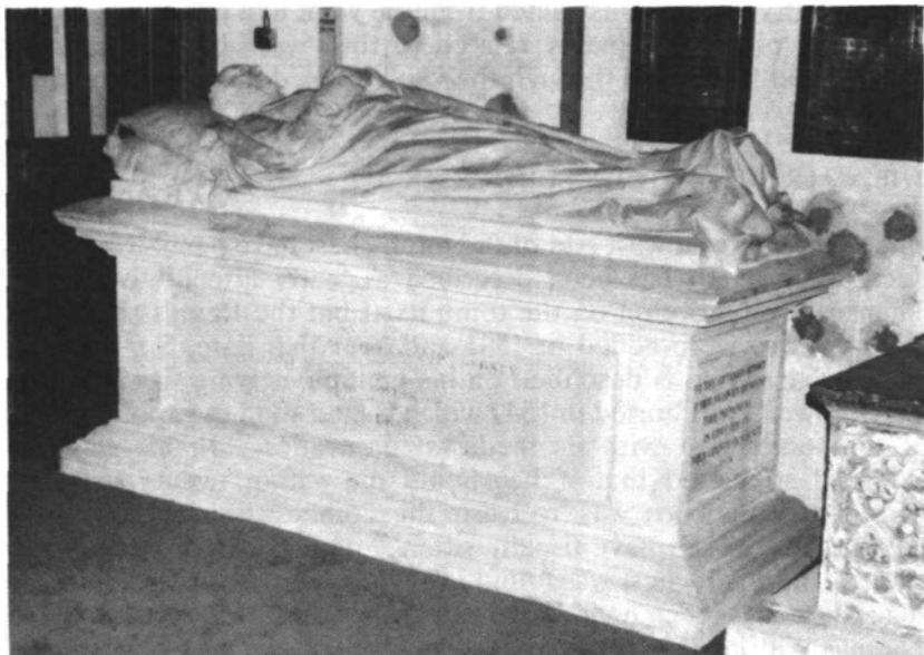
Monument to Earl Sydney, after its Removal to the north-west Corner of the Chapel, 1985

have been not less than 6 ft. The red bricks of the walls were laid in English bond, each measuring approximately 9 by 4½ by 2 in. So far as could be judged, the construction was compatible with a late-fifteenth century or sixteenth-century date. It was noted that the vault extended under the tomb-chest to within a few inches of the north wall of the chapel.